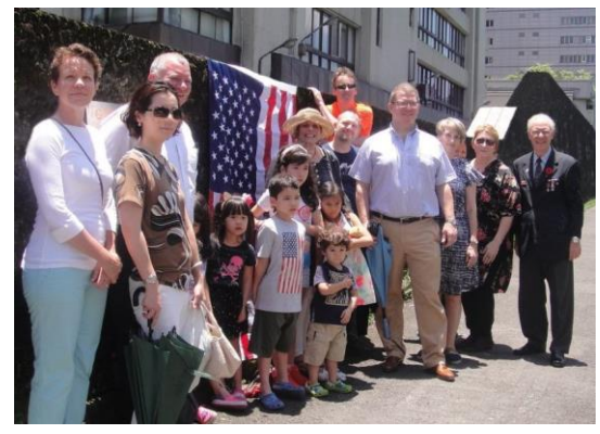
Some of the participants pose for a photo at the wall after the Memorial Day event.

As the American flag hung from the wall beside the memorial plaque, tributes were given and a list of all the American POWs who died in Taiwan was read by the Society director. Taps was played and a moment of silence observed. The ceremony, organized by Democrats Abroad Taiwan , was simple and sincere and was followed by a lovely fellowship lunch at the nearby Kao-Chi restaurant.