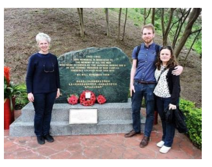
At Taihoku Camp 6 Memorial.

Time did not permit a visit to all three of Walter's camps, but they were able to see the Taihoku Camp 6 area and also spend a whole day visitina Kinkaseki and the POW Park. very It was а informative and