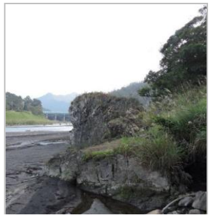
(L) Part of the old trail winds through the bush.(R) The former boat landing as it looks today.

We followed the trail for a number of miles and then where it descended to the river, we found the old boat landing where the POWs were supposed to have had boats waiting for them on their return to Taihoku. We carried on as they did - on foot, finally reaching Hsintien again about dusk, tired but happy to have been able to really follow in the footsteps of the men of Kukutsu. It was not an easy trek and it gave us a real appreciation for what the men had to go through in their weakened and emaciated state. We must never forget the hardships they suffered.