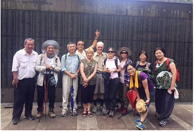
Sharing the POWs' story with a very appreciative group of interested Taiwanese at Jinguashi.