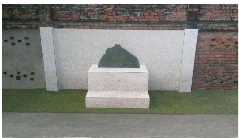
The newly refurbished Taichu POW Camp Memorial. It will be dedicated on Monday November 13th 2017.