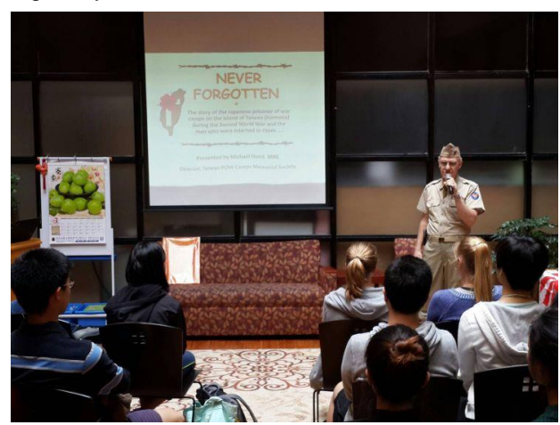
Sharing the POWs' story

I focused on the American POWs who came to Taiwan after the fall of the Philippines and the Bataan Death March, and of the camps they were in and the things they suffered for our freedom.