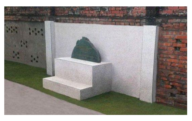
The new Taichu POW Camp Memorial.

It was a wonderful feeling to finally see the stone in its new base in the garden not far from where the prisoners' huts had previously been located those many years ago. It is a great tribute to them.