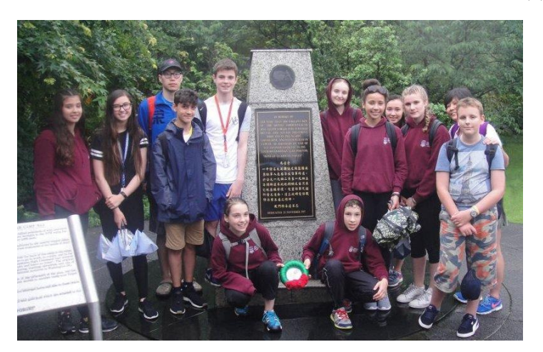
George Watson's College Junior High Students and teachers from Edinburgh lay a wreath at the memorial.